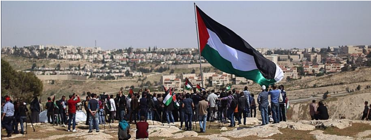
Bab Al Shams in Ezarriya Town Lands (Maale Adomim), settlement in the background, March 20, 2013/ Photo by Fadi Arouri.