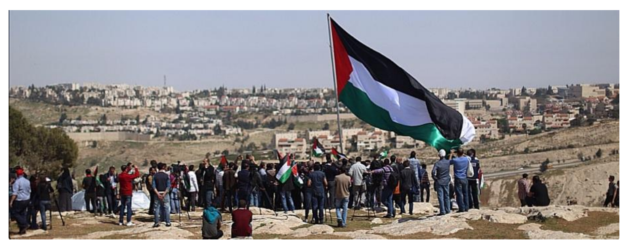
Bab Al Shams in Ezarriya Town Lands (Maale Adomim), settlement in the background, March 20, 2013/ Photo by Fadi Arouri.